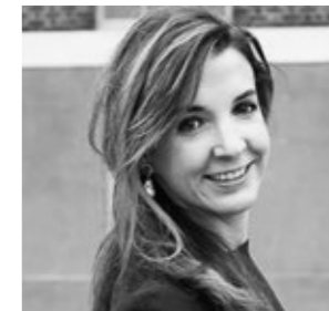
Princess Tessy of Luxembourg Director, Vice Impact