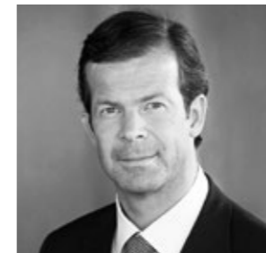
S.D. Prince Maximilian of Liechtenstein CEO, LGT Group