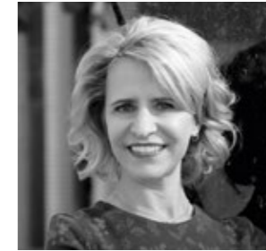
Dr. Aurelia Frick Minister of Foreign Affairs, Justice and Culture, Liechtenstein