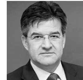
H.H. Miroslav Lajčák Minister of Foreign and European Affairs of the Slovak Republic