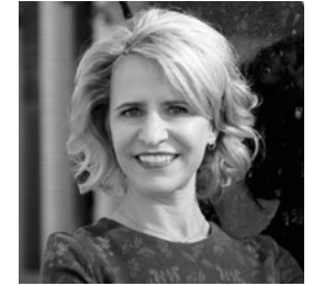
Dr. Aurelia Frick Minister for Foreign Affairs, Justice and Culture, Liechtenstein