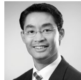
Dr. Philipp Rösler CEO, Hainan Cihang Charity Foundation